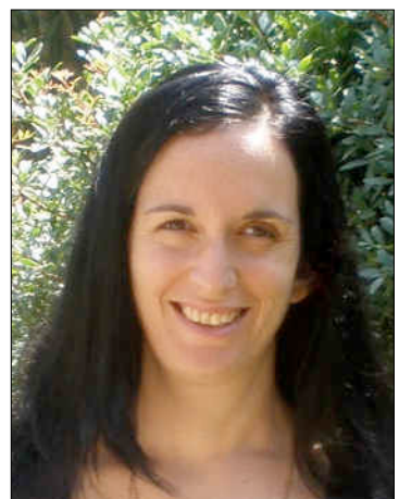
"Mindfulness creates a gap between our stimulus and our reactions". Maya Shalem